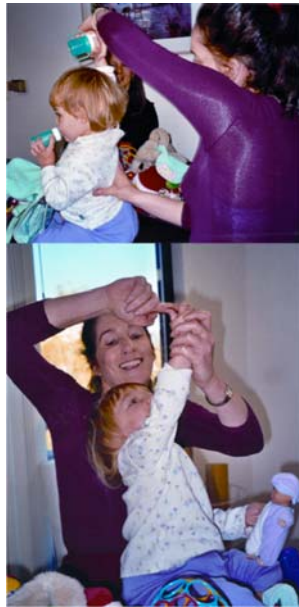
The arm does not move in isolation, but is a part of the organization of the whole body.

Copyright 2003, Anat Baniel Method SM . All Rights Reserved.